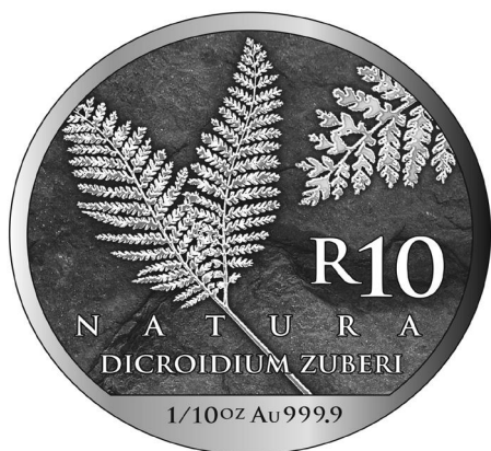
Reverse: R10 (1/10oz, Au 999.9)