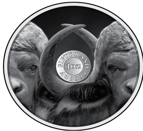
Reverse Buffalo: R50 (1oz, Au 999.9)