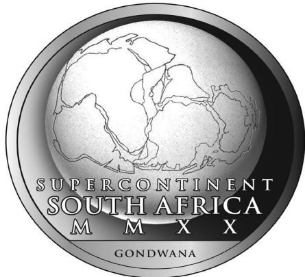
Common obverse (1oz, 1/2oz, 1/4oz, 1/10oz and 1/20oz)