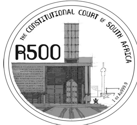
Reverse: R500 (1oz, Au 999.9)