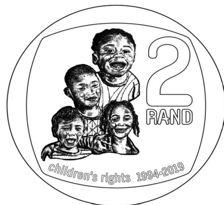
Reverse: R2 (base metal)