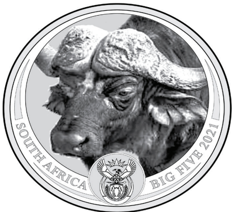
Obverse Buffalo: R50 (1oz, Pt 999.5)