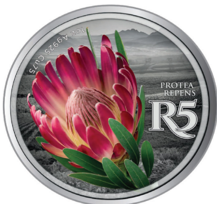
Reverse: R5 (1oz, Ag 925 Cu 75)