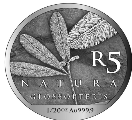
Obverse: R5 (1/20oz, Au 999.9)