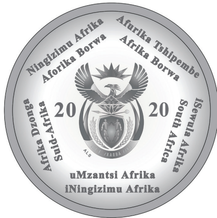
Obverse: R2 Crown (1oz, Ag 925 Cu 75)