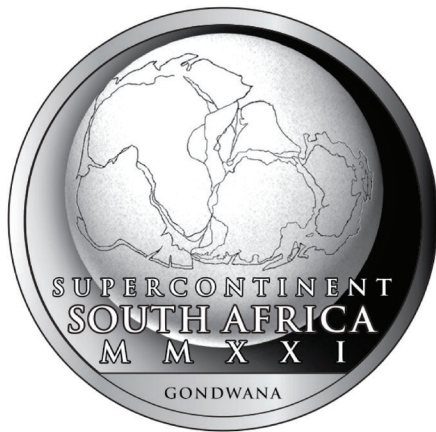
Obverse: R25 (1oz, Ag 999)