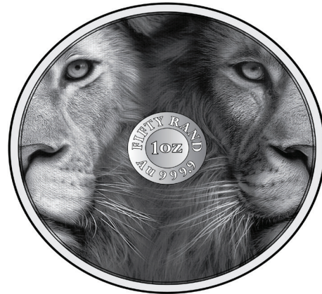
Reverse Lion: R50 (1oz, Au 999.9)