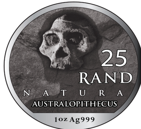
Reverse: R25 (1oz, Ag 999)