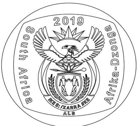
Obverse: R2 (base metal)