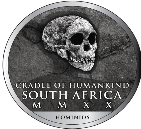
Obverse: R25 (1oz, Ag 999)

R25 fine-silver coin: Cradle of Humankind – Hominids