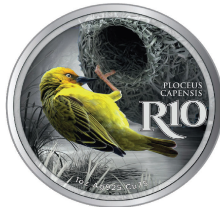
Reverse: R10 (1oz, Ag 925 Cu 75)