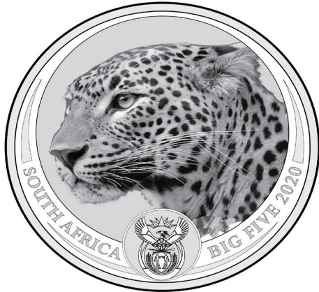
Obverse Leopard: R50 (1oz, Pt 999.5)