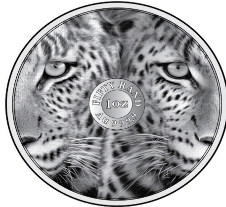
Reverse Leopard: R50 (1oz, Au 999.9)