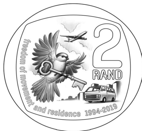
Reverse: R2 (base metal)