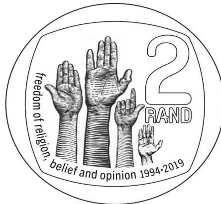
Reverse: R2 (base metal)