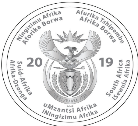
Obverse: R50 (1oz, Ag 925 Cu 75)