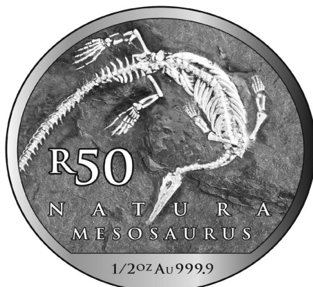
Reverse: R50 (1/2oz, Au 999.9)