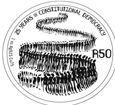
Reverse: R50 (1oz, Ag 925 Cu 75)