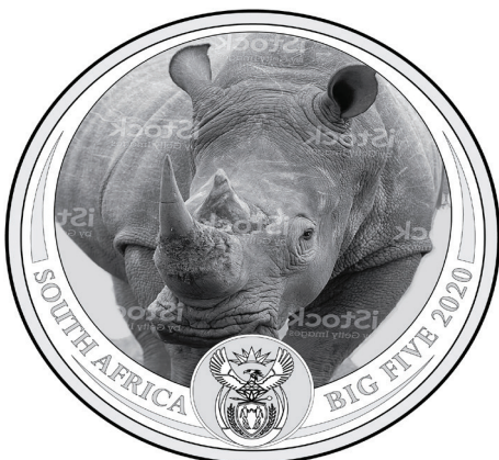
Obverse Rhino: R50 (1oz, Pt 999.5)