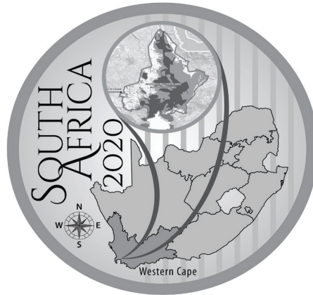
Common obverse (2x R10 1oz, and 2x R5 1oz)