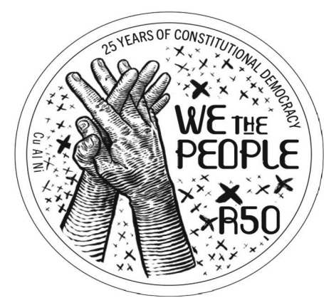
Reverse: R50 (base metal)