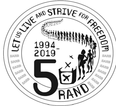
Reverse: R5 (bi-colour base metal)