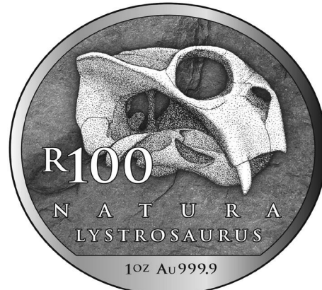
Reverse: R100 (1oz, Au 999.9)