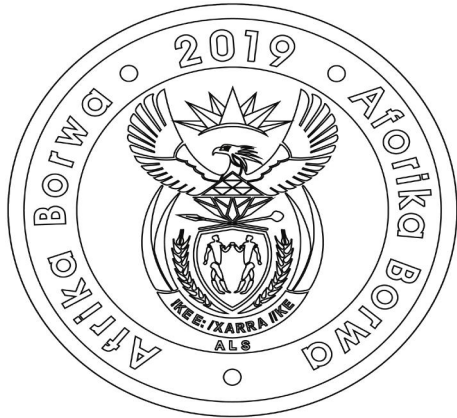
Obverse: R5 (bi-colour base metal)