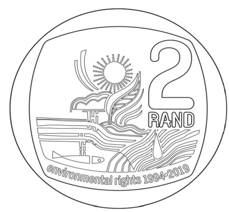
Reverse: R2 (base metal)