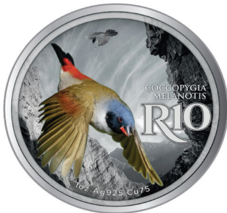
Reverse: R10 (1oz, Ag 925 Cu 75)