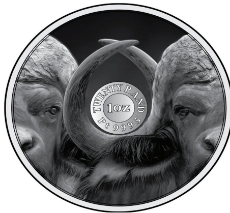
Reverse Buffalo: R50 (1oz, Pt 999.5)