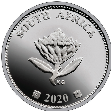
Obverse: 2 1/2 c Tickey (Ag 925 Cu 75)