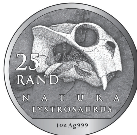
Reverse: R25 (1oz, Ag 999)