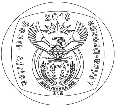
Obverse: R2 (base metal)