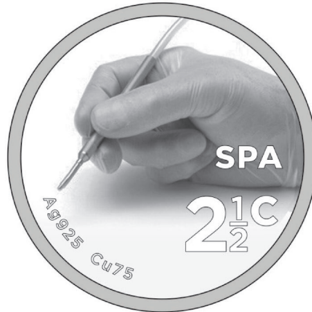
Reverse: 2 1/2 c Tickey (Ag 925 Cu 75)