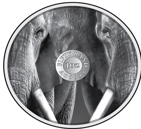
Reverse Elephant: R50 (1oz, Au 999.9)