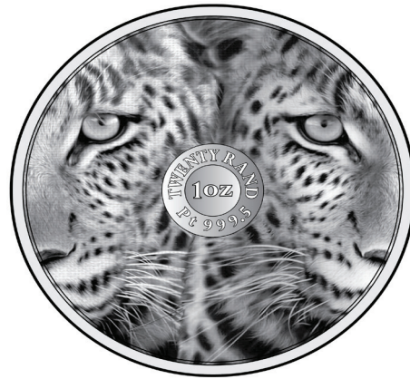
Reverse Leopard: R50 (1oz, Pt 999.5)