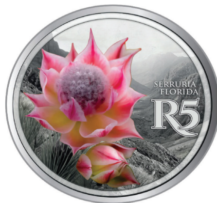
Reverse: R5 (1oz, Ag 925 Cu 75)