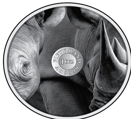
Reverse Rhino: R50 (1oz, Au 999.9)