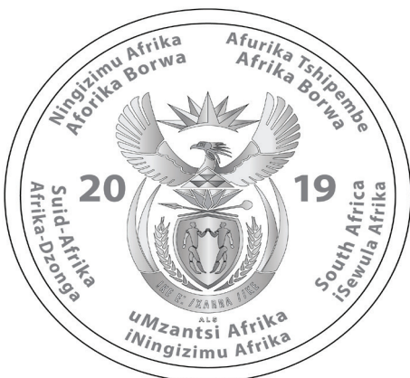
Obverse: R50 (base metal)