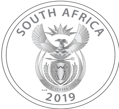
Obverse: R500 (1oz, Au 999.9)