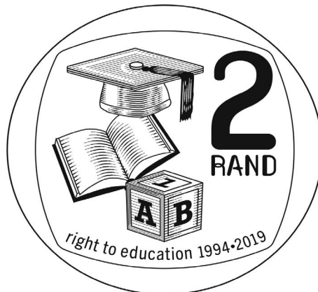
Reverse: R2 (base metal)