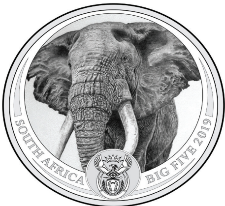
Obverse Elephant: R50 (1oz, Au 999.9)