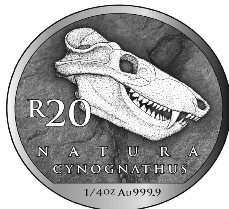
Reverse: R20 (1/4oz, Au 999.9)