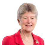
Jane Hutt AM Welsh Labour Vale of Glamorgan