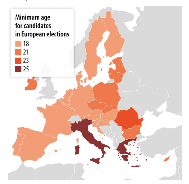
Figure 2 – Age to stand as a candidate for the European Parliament

Graphic by Samy Chahri.